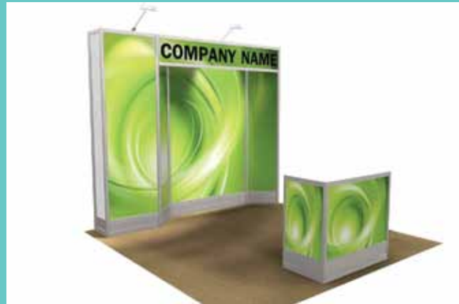
Package 5 upgraded with graphics and cabinet