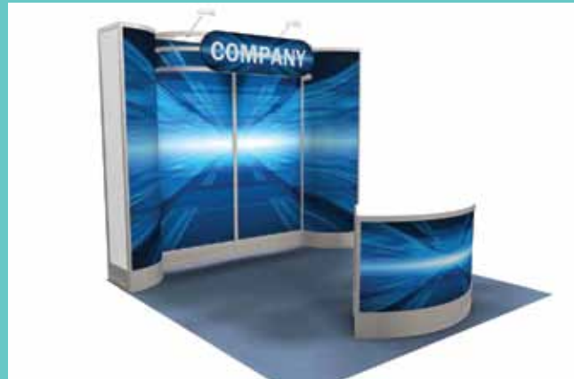
Package 6 upgraded with graphics and cabinet

* All exhibits include: installation & dismantle of exhibit, material handling of exhibit, classic carpet with nightly vacuuming, 2 arm lights (per 10' unit), power (500 watts) for lights ONLY and labor to hang arm lights.