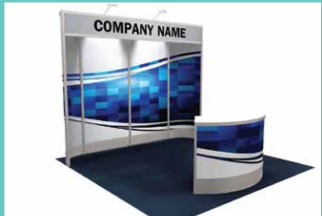
Package 2 upgraded with graphics and cabinet