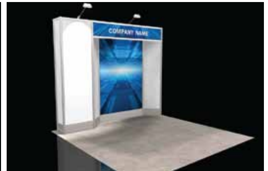
Graphics & Custom Logo