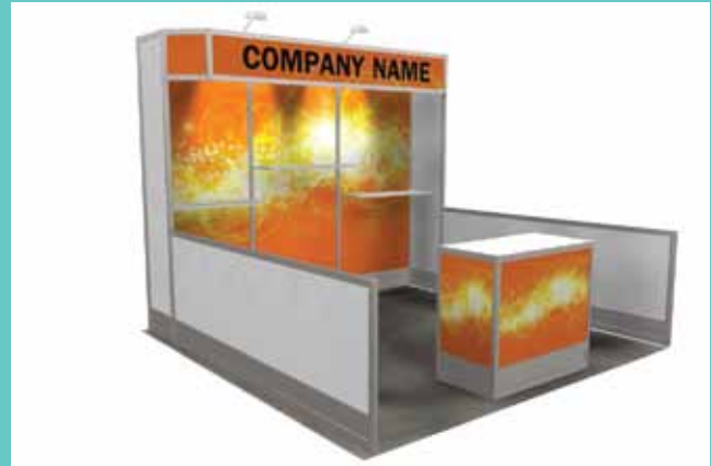
Package 1 upgraded with graphics and cabinet