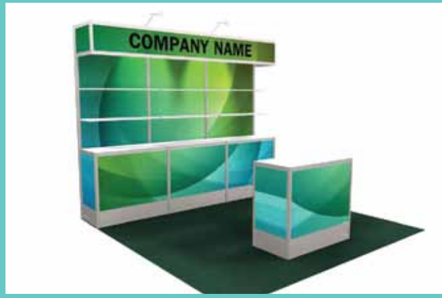
Package 4 upgraded with graphics and cabinet