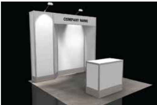
Cabinets & Counters