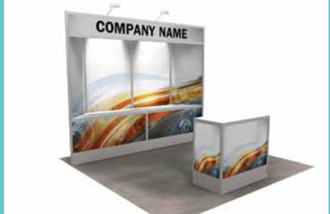
Package 3 upgraded with graphics and cabinet