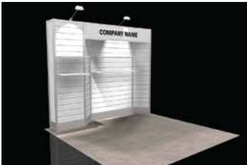
Slatwall & Shelves