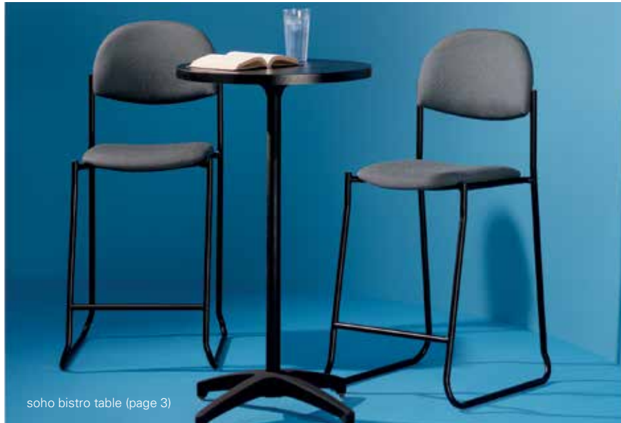
soho bistro table (page 3)